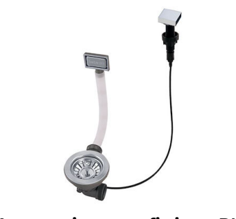
Automatic waste fitting - PM 8407 113